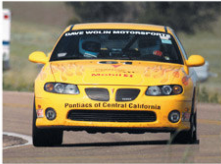
The 2004 Pontiac GTO is one of the world's fastest production two-door sedans.