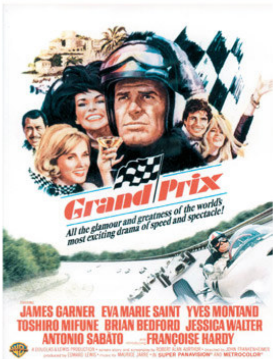
Above: The 1966 film "Grand Prix" will be among the films screened at the festival. The movie's star, James Garner, is expected to be in attendance to receive a Lifetime Achievement Award.